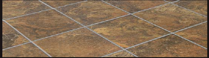
Kenya Slate - I37824