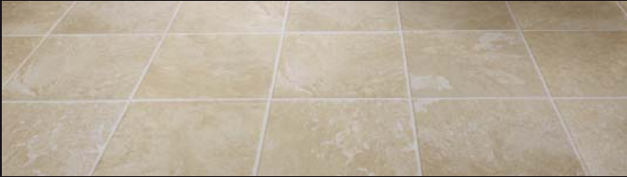
Madera Slate - I37826