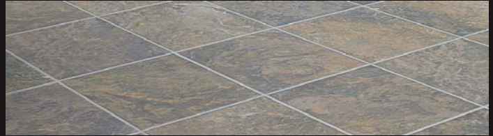
Sabatini Slate - I37827