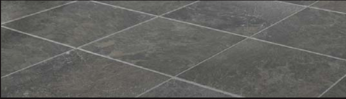
Vulcan Slate - I37823