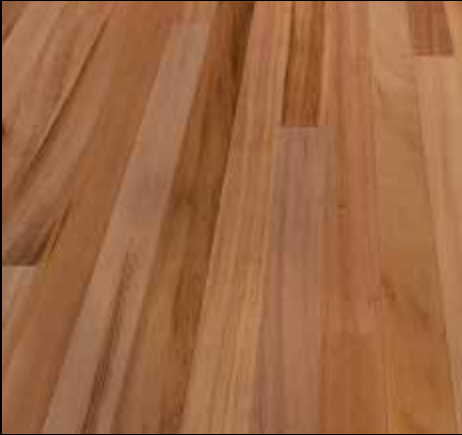
Tigerwood - 1588