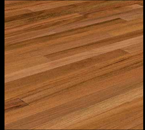
Brazilian Teak - 1594