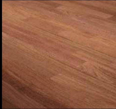
Brazilian Cherry - 1590