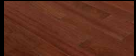
Brazilian Cherry - 144AA8