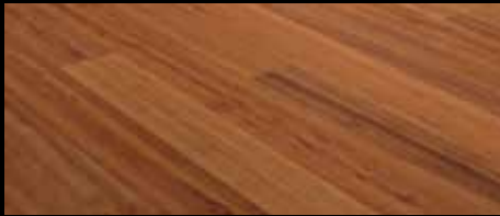
Tigerwood - 144AA9