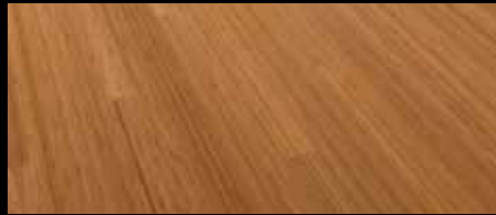
Bodega Bamboo - 144AA7