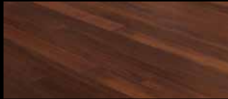
Amalda Acacia - 144AA10