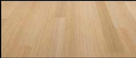
Natural Bamboo - 144AA6